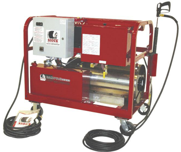
Model H4D2750 High Pressure Hot Water Washer 7.5 HP, 4 GPM, 2750 PSI, Oil-Fired

All steam cleaners are not the same. At comparable flow rates, a 320°F (160°C) steam cleaner produces approximately 40% more steam and will transfer approximately 13% more heat to the surface than the 290°F (143°C) steam cleaner. The increased heat and steam also significantly increase the cleaning impact , as illustrated in the chart below: